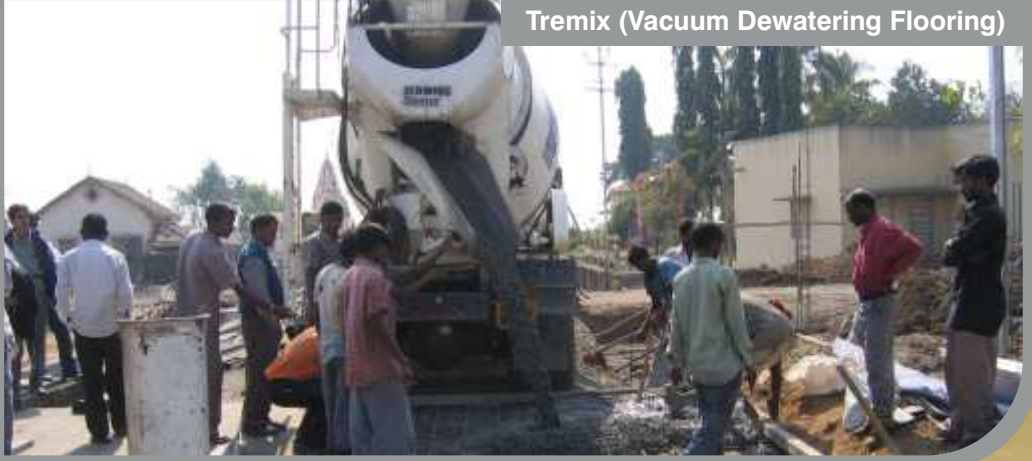
Tremix (Vacuum Dewatering Flooring)