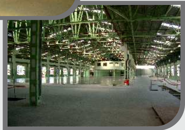
Mahindra Defence 100000 sq feet