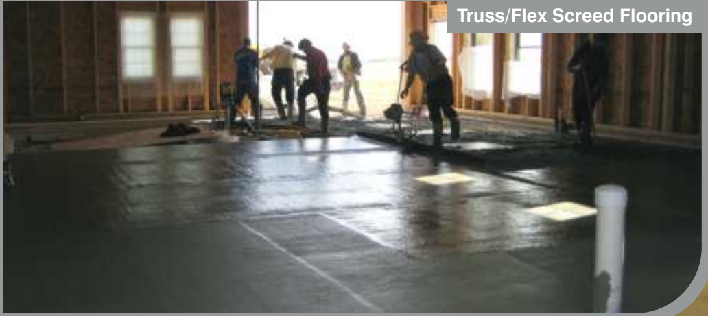
Truss/Flex Screed Flooring