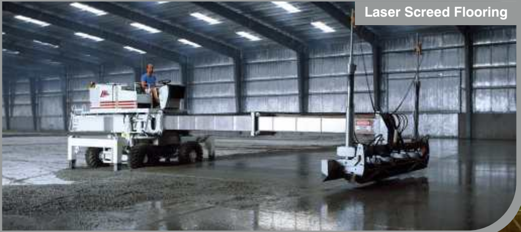
Laser Screed Flooring